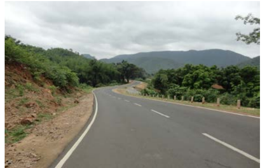
Completed stretch of South North Corridor

It was noticed that out of 34 projects so far sanctioned, the estimates of 24 projects funded by GoI/ State Government were sanctioned by CE providing 10 per cent towards overhead charges and contractor's profit. The remaining 10 projects were financially and technically approved by MoRT&H based on estimated cost arrived at by the CE. In seven 54 of them (estimates of three projects were not made available to audit) the CE adopted 8 per cent towards overhead charges and another 10 per cent thereon for contractor's profit working out to 18.8 per cent on account of overheads and contractor's profit on work components as per MoRT&H data book.