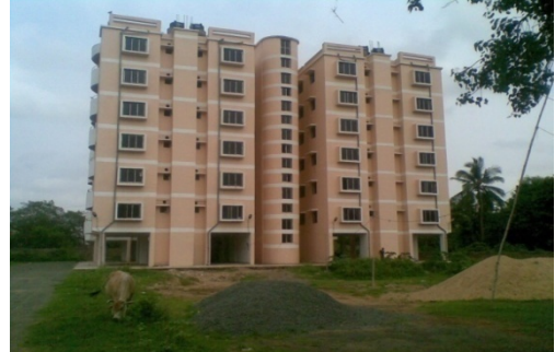
Multi-storied Residential Building for doctors, SCBMCH, Cuttack

In three divisions, six 15 works (Civil and PH) were awarded between August 2010 and November 2011 at a cost of ₹ 11.97 crore for completion between September 2011 and October 2012. Civil and PH works of two buildings were completed. Finishing work of remaining four buildings could not be taken up for want of electrical installations. Hence, buildings could not be handed over to user department. Expenditure incurred on these buildings was ₹ 9.51 crore. No tender was invited (July/August 2013) for electrical installation works.