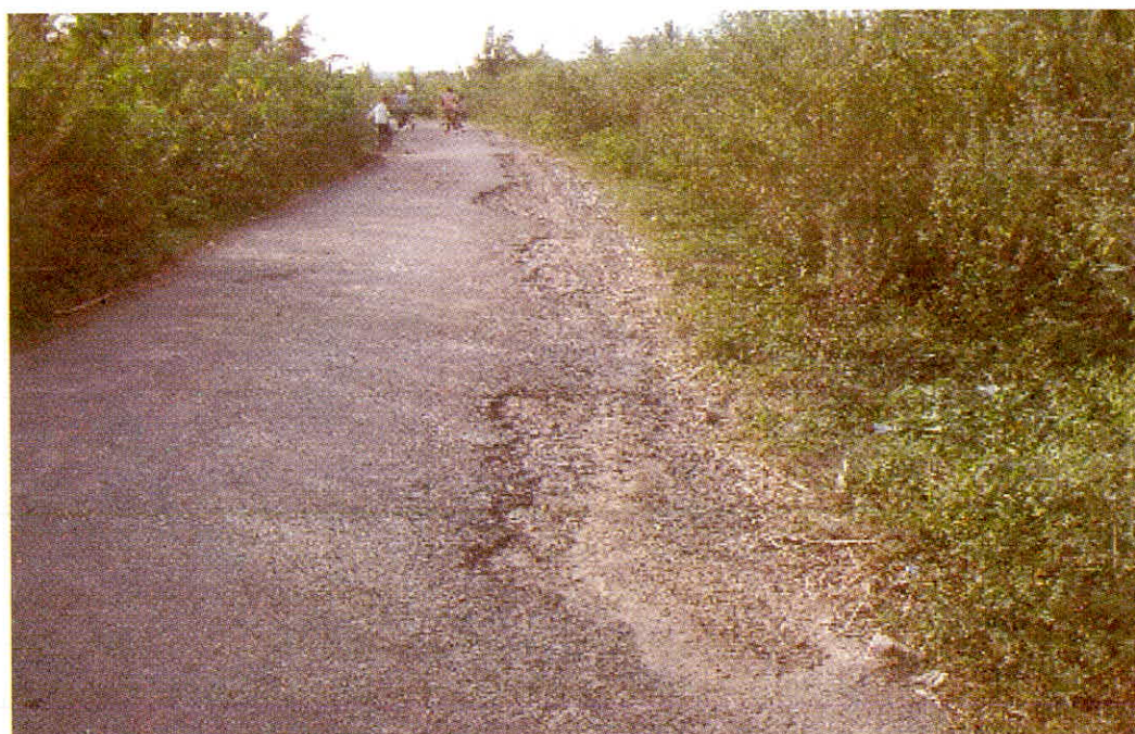
Status of road from BH Road to Tippalapura in Bhadravathi taluk