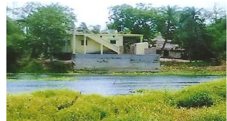
Encroachment of river Salandi

Salandi Sanskar Project, one of the eight projects test checked, basically a flood protection scheme of river Salandi, a part of integrated Anandpur Barrage Project was approved by Planning Commission in October 2003 at an estimated cost of ₹ 99.14 crore for completion by 2007-08. Project provided for raising and strengthening of embankment over a length of 67.4 km by 1.22 m over the maximum water level, widening the river bed to 98 m from RD.52.80 km to RD.61.10 km and