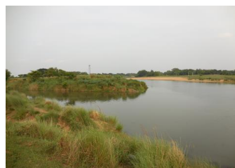
Gangua Nallah mixes with river Daya carrying waste water of Bhubaneswar city