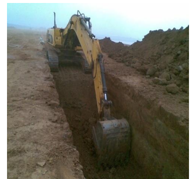
Excavation of vertical chimney by mechanical means

Thus, unwarranted adoption of manual means in estimates despite provision of execution of work through mechanical means in the agreement led to extra cost of ₹ 1.12 crore towards excavation of 5.36 lakh cum of earth and extension of undue benefit to the contractors.