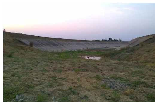
Collapsed portion of SMC from RD 7950 to 8720 M

Subarnarekha Main Canal of 46.50 kilometer (km) length is feeder channel for SIP. Works of concrete lining of canal and restoration of canals with service road were awarded to six contractors between December 2006 and April 2011 for completion between June 2008 and December 2013. Though four completed (December 2013) their works within the extended time, two contractors stopped (June 2012/April 2013) work (after execution of 68 per cent of work) due to repeated collapse of canal since December 2006. The collapse of canal is because of presence of kaoline soil, which the Department had not identified initially due to improper survey and investigation. Despite the above problem, Department had not taken any action (March 2014) for completion of balance restoration and lining of canal works.