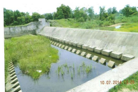
Semelmunda Diversion weir

Under AIBP, 60 MIPs were sanctioned during 2007-09 at a cost of ₹ 137.65 crore for completion between 2009-10 and 2010-11. Of the 60 projects, only three projects were completed at a cost of ₹ 3.02 crore. Of the balance 57 projects, head works for 27 projects sanctioned at an estimated cost of ₹ 53.93 crore were completed with an expenditure of ₹ 48.48 crore and distribution system to carry water for irrigation purpose could not be completed due to non acquisition of land. This resulted not only in blockage of ₹ 48.48 crore for more than one to three years but also deprived people of the area of benefit of irrigation. Further, 22 projects with approved cost of ₹ 44.43 crore to provide irrigation to 5,715 ha though awarded could not be completed even after incurring expenditure of ₹ 46.40 crore on head works.