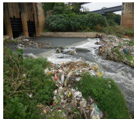
Untreated waste water of Cuttack city being discharged to river Kathajodi at Khan Nagar

Audit observed that two natural nallahs – Budu Nalla at Mancheswar and Gangua Nalla at Samantarapur were converted into sewer lines to carry untreated city sewage of Bhubaneswar to drain into rivers Kuakhai and Daya respectively. The sewage of Cuttack City was also found directly discharged to river Kathajodi near Khan Nagar without any treatment. Quality of water in these rivers after they leave the cities should meet class B criteria (Bathing standards) as designated by CPCB. Water samples were collected and checked in SPCB laboratory which showed BOD, DO and TC in high quantities as detailed in Appendix -2.2.3.