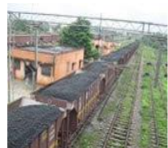
Transportation of minerals through open Railway wagon at Mancheswar Railway Station, Bhubaneswar