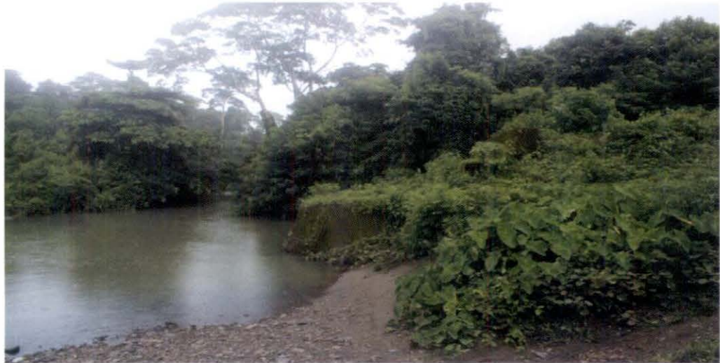
Pic 2: Bridge at Panchwati at Chainage 162.00 - only abutment and wing wall constructed

Thus, inaction of the Department to get the bridges constructed resulted in wasteful expenditure of ₹ 46.06 lakh, and non-achievement of objectives.