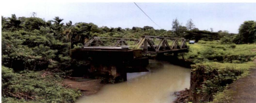
Pic 1: Bridge between Shamkund and Kalsi connecting road at ward No.1 Bakultala

be completed by March 2006. Against tendered amount of ₹ 35.64 lakh, ₹ 16.87 lakh was paid to the contractor (March 2005). The contractor communicated (May 2008/ July 2009/ December 2009) that after the Tsunami of December 2004, the width of the nallah had increased and thus it was not possible to fix 20 metre span bridge over the site. The Assistant Engineer (AE), Rangat, also reported (July 2009) that the abutment constructed for the above work had slid from its alignment and fallen and was of no use. However, ZP did not act on the contractor's letters or the report of the AE, and the contractor completed the steel bridge of 20 metre width by June 2014 and was paid ₹ 26.85 lakh up to December 2014. Since the width of the stream is wider than the bridge length, the bridge is not connected to the two banks and cannot be used, resulting in wasteful expenditure of ₹ 26.85 lakh. The Department accepted (September 2016) the facts.