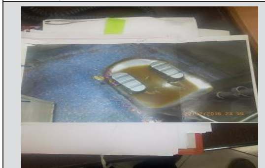
Fig 8: Choked bio-toilet in Train No 22443/44 (NCR)