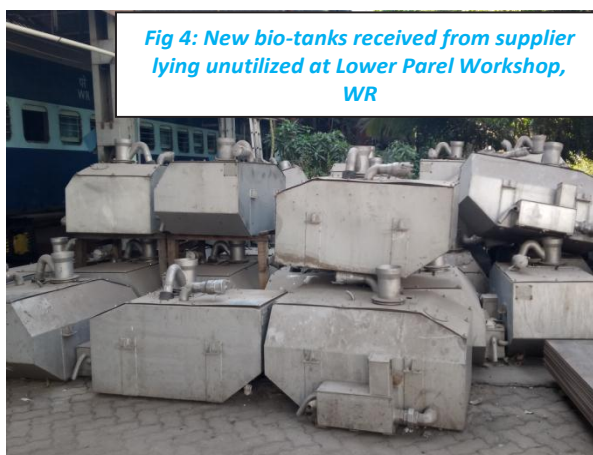
Fig 4: New bio-tanks received from supplier lying unutilized at Lower Parel Workshop, WR