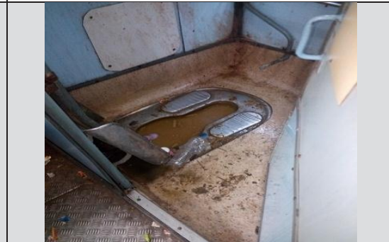
Fig 9: Choked and unclean bio- toilet in Train No. 19270 (WR)