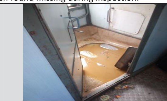
Fig 7: Choked Bio-toilet in Train No. 19270 (WR)