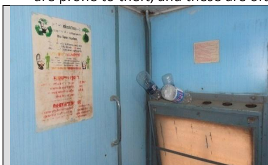
Fig 6: Water Bottles were used by Passengers and kept on window in Train No. 82652 (SWR)