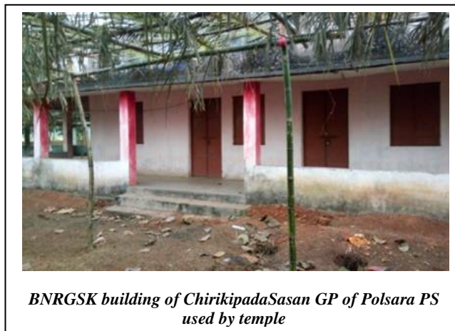
BNRGSK building of ChirikipadaSasan GP of Polsara PS used by temple

Audit noticed that the buildings were unauthorisedly, (i) occupied by local people (Derabish and Aul PS), (ii) used by a temple (Polsara PS), (iii) used as local police station (Marshaghai PS) and (iv) utilised as a PDS store and shop (Marshaghai PS).