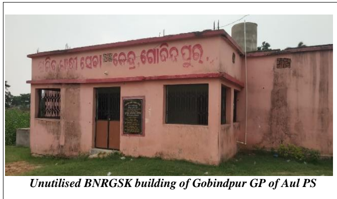
Unutilised BNRGSK building of Gobindpur GP of Aul PS

Nine BNRGSK buildings constructed in four PSs 77 during November 2011 to June 2013 with an expenditure of ₹85.70 lakh ( Appendix 2.8.1 ) were not put to use for more than six to eight years since their completion. In