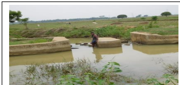
Incomplete Check dam on Sunamuhi Mundakara jore at Tangi Choudwar Block

Audit also found 11 check dams lying incomplete for a period ranging from 18 to 72 months from the stipulated date of completion 75 after incurring an expenditure of ₹ 30.53 lakh ( Appendix 2.7.2 ). Although Audit did not find any recorded reasons for non-completion, it is viewed that the concerned BDOs had not monitored the timely progress of the projects resulting in unfruitful expenditure of ₹ 30.53 lakh.