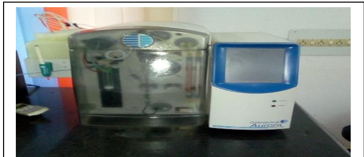
Total Organic Carbon Analyser lying idle in old State PH lab, Bhubaneswar due to non-receipt of the job consequent upon establishment of new lab on PPP mode

for the State WTL but the same remained idle due to non-receipt of water samples for testing. Despite availability of these equipment, the same