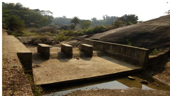
Check Dam at Mardarajpur GP of Khandapada Block without agriculture land

Thus, deficient planning, inappropriate site selection, improper designing and lack of farmers' involvement before selection of sites resulted in non-utilisation of the check dams rendering the