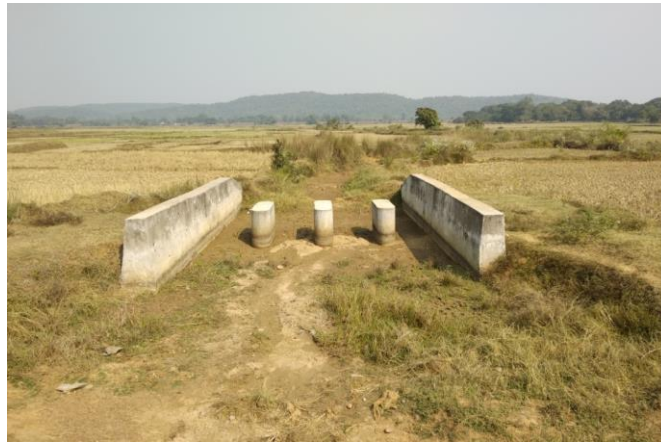
Check Dam on Samuka Nala in Benagadia GP of Khnadapada Block without space for storage of water

The replies are not tenable as instructions of the Department for selection of sites for the check dams by involvement of technical functionaries and farmers participation were not followed leading to non-achievement of desired outcomes. Also, the locations of the completed check dams were such that the intended benefits of the check dams were unachievable. It was noted that in 19 cases there was no agricultural land either upstream or downstream, in six cases there was no water storage facility, in four cases water could not have reached the fields as they were upstream and in one case there was no space for the reservoir.