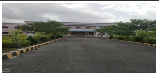
Newly constructed B.Ed. college building at Malkangiri lying idle

On joint physical inspection of the college (30 October 2019), Audit found that the college building (as shown in the photograph) was lying idle. Audit observed that it was only after a lapse of